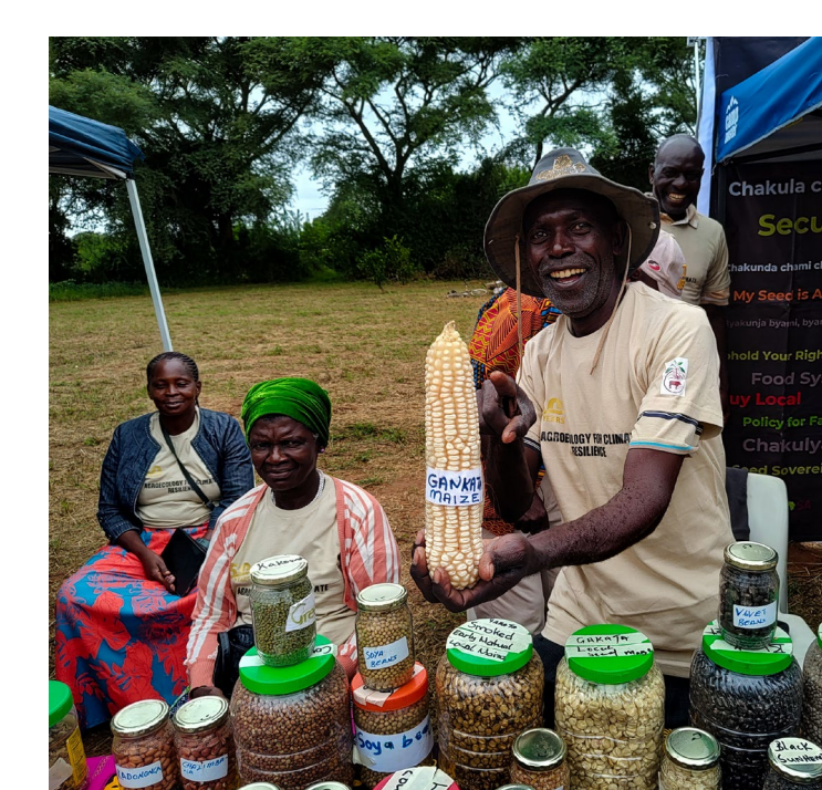
Agricultural Seed Show at KATC, Photo: Peter Reutter